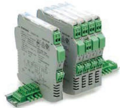
Dimensions: 118.9mm × 106.0mm × 12.5mm